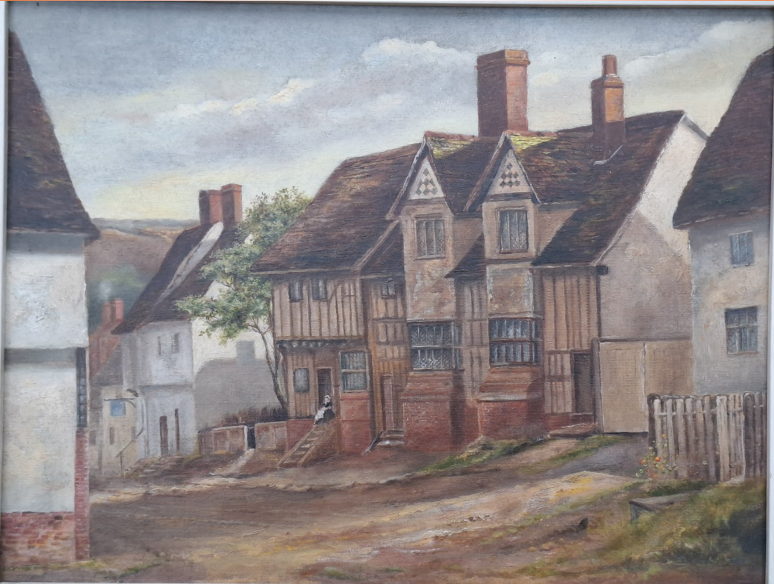
Kersey

Down the steep hill where the waters play Past timbered beams of pink and grey In Kersey town, the minutes creep, Where quiet shadows softly sleep.