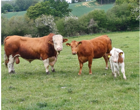
Novak, our Simmental bull with a cow and one of his daughters

Since we have been selling most of our bulls to the Cogent stud there is less need to show cattle. Added to this there is a risk in taking high health status cattle to shows as they might bring home a problem which could be very costly. So now we just show some sheep which gives time to enjoy the show, network, and socialise.