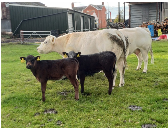
Wagyu calves with their British Blue mothers

The use of artificial insemination (AI) in cattle is not a new science but since I trained to do it and got all the gear it has been very useful in our cattle breeding programs. I have also used AI to introduce other breeds of cattle to the herd: Simmental, Aberdeen Angus, Blonde Aquitaine and Stabiliser have all been used to advantage. The most recent breed which we have tried is the Wagyu. This is the Japanese breed which is known for producing Kobe beef (very expensive, high quality beef, which is produced when the cattle are fed beer and massaged!) Look it up if you don't believe me! The calves are very small (35kg) when born so I used some Wagyu semen on our pedigree British Blue heifers to give them an easy first calving. Hopefully the crossing of these two breeds will produce lovely high quality beef although I won't be massaging them, and I will probably drink the beer!