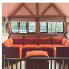
CORNER SOFAS & SOFAS