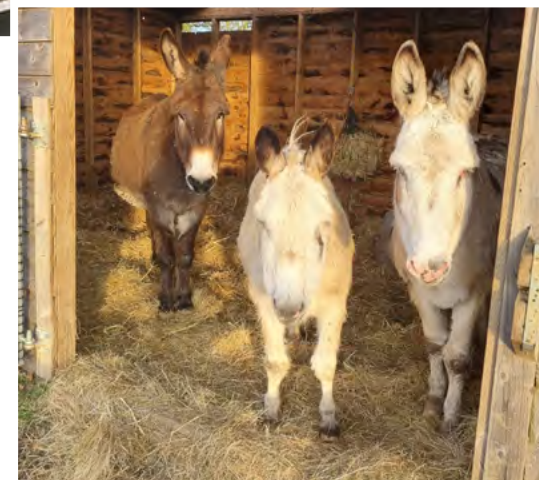
Here are a few photos of some of the animals in our care: